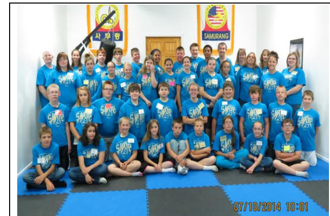
The 2014 SWOP Teams

Over the past 17 summers, SWOP has made a difference in the lives of over 450 youth in the communities of Mt Iron, Buhl-Kinney, Chisholm, and Virginia.